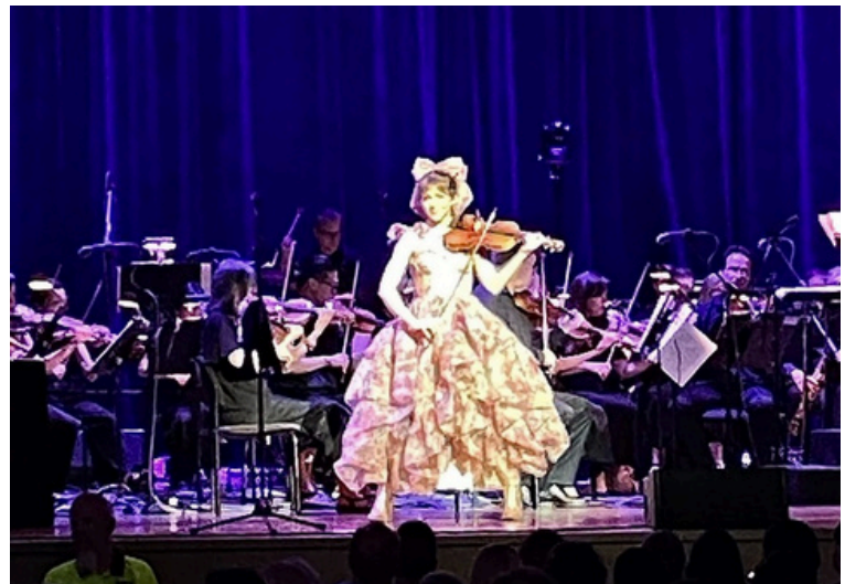
Lindsey Stirling and the Chicago Philharmonic Orchestra