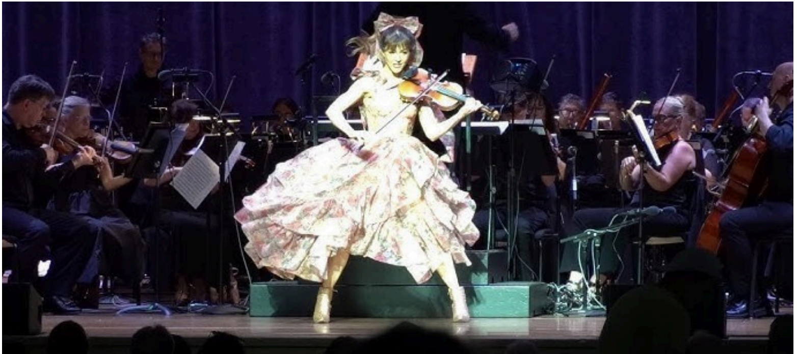
Lindsey Stirling and the Chicago Philharmonic Orchestra

Following a little bit of a wait we board our train to the Ravinia park stop. We enjoyed our little ride there. Once reaching our stop, we disembark and head off into the lovely yet still heat sweltering Ravinia park. It took us a little to get to the pavilion where we caught a glimpse of Lindsey doing the VIP group stuff. Perhaps someday I can do something like that, that's the dream ain't it? So, with some good amount of time we found our way to the Lindsey merch store area where I bought a pin and a poster which I hope to frame on my wall somewhere. It was right after this, scattered thunder showers were passing by and would remain in the vicinity for most of the night cooling off temperatures into the upper 70s. It was a little miracle of sorts and once I bet Lindsey and the orchestra were as grateful as we were.