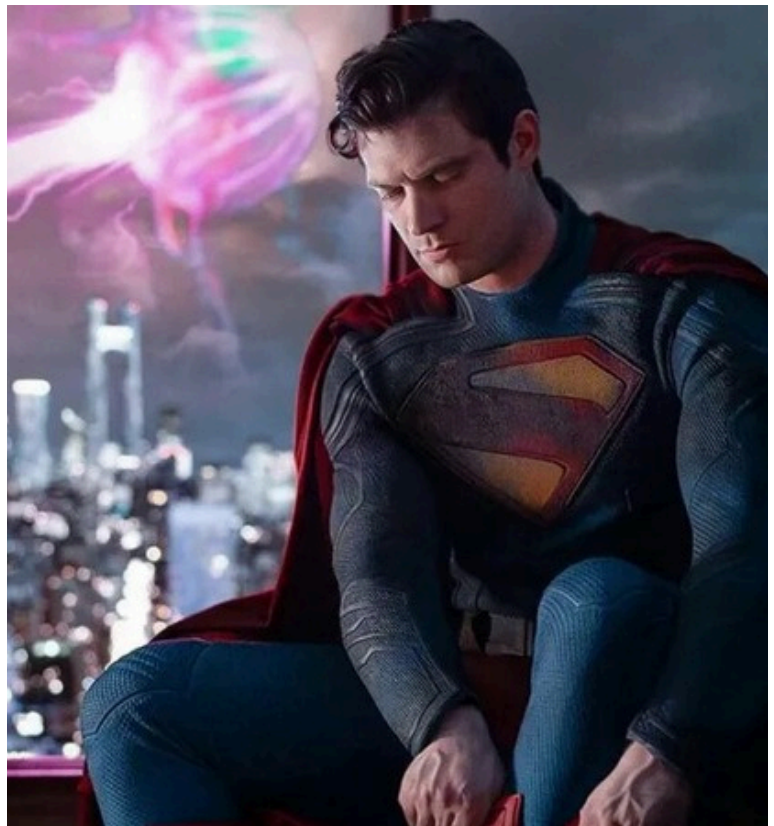
'Superman' Soars Again