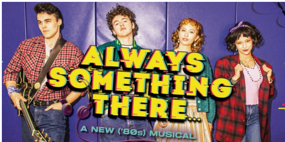
Always Something There

We went to the Marriott Lincolnshire where we saw Joseph and the Amazing Technicolor Dreamcoat. This time we saw the 80's mixtape musical Always Something There. It is about a mom that wants to go back in time and live her life in the 80's when she was in high school. The mother makes a birthday wish and then gets stuck in the 80's as her younger self with the best music including the songs that we know of like The Go-Go's and Steve Perry. The best part was when they were doing the battle of the bands and made many new jokes. The band was called The Rubber Bands that had Cooper as the lead singer. They do music of the inspiration of the 80's from back then, references to movies like The Breakfast Club and Back To The Future. They do dance a lot because there were lights that changed colors from both sides of the stage. The best part was getting there and back from Gordon Ramsay's Burger Place to the Riverwalk, where we saw the people kayaking and boats touring around the downtown area of Chicago.