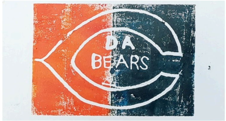
Art by P.K.