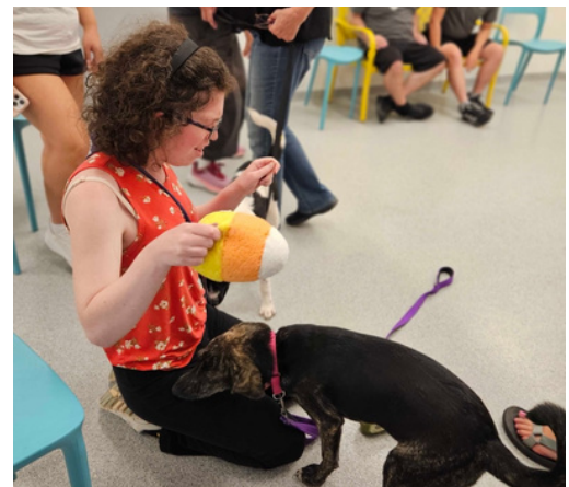
Heartland Animal Shelter