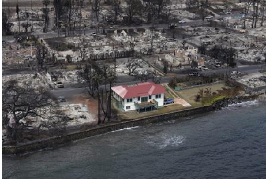
Kevin Fujii / Civil Beats / 2023