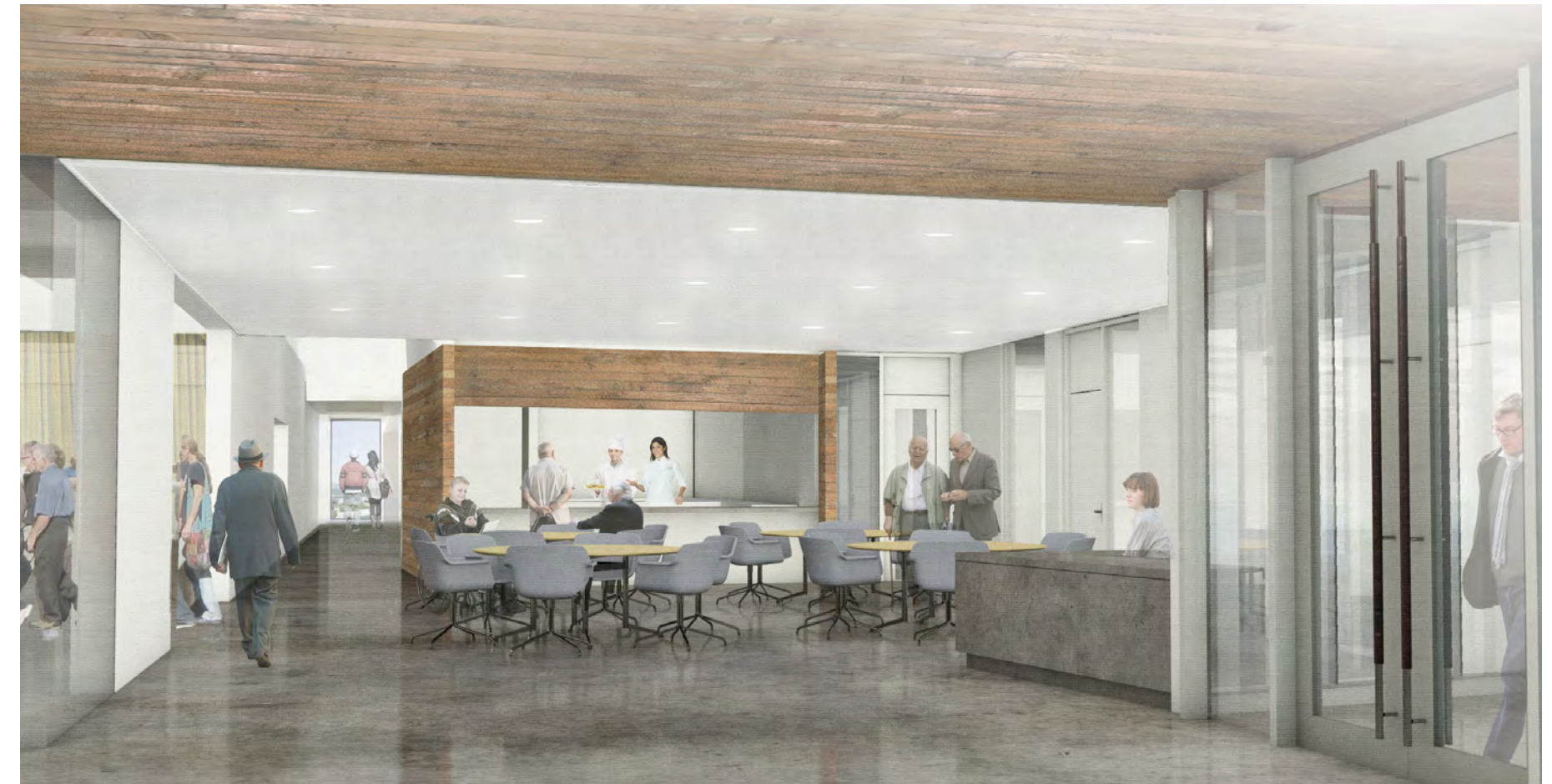
PERSPECTIVE 55+ LOUNGE & COMMUNITY KITCHEN