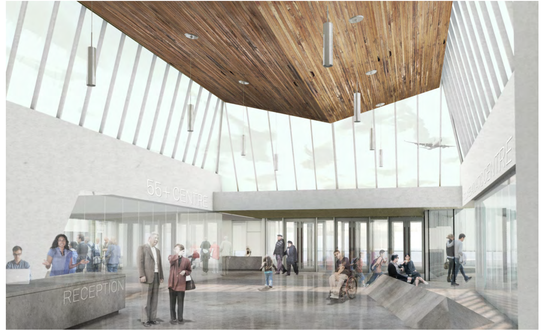
PERSPECTIVE CIVIC HALL LOOKING SOUTH