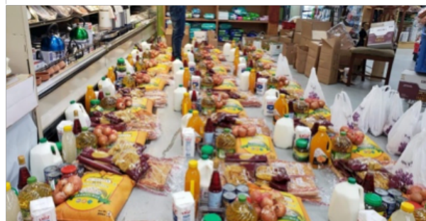
Montgomery County Muslim Foundation 14,700 lbs. refugee food distribution