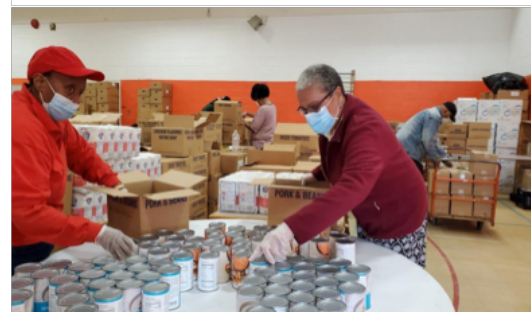
Church of Jesus Christ of Latter-Day Saints, Langston Hughes Community Center, Baltimore