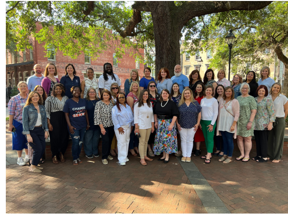
Council of Programs, May 2022