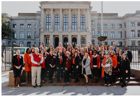
CASA Day at Capitol In-Person Attendees