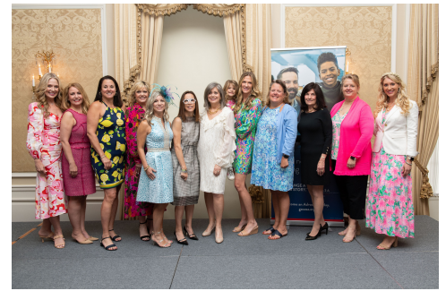
Luncheon & Fashion Show Committee