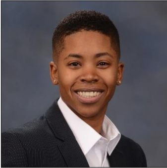
Senator Dallas Harris

Dallas.Harris@sen.state.nv.us (775) 684-6502