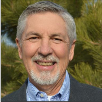
Senator Dennis Hisey

dennis.hisey.senate@state.co.us (303) 866-4877