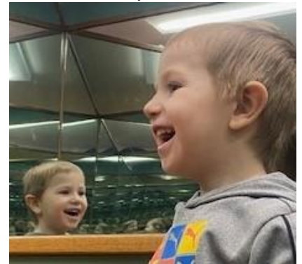
Field trip HERE