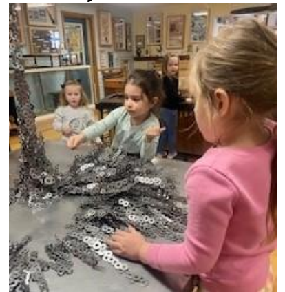
Field trip HERE