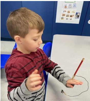
Outreach THERE in the classroom