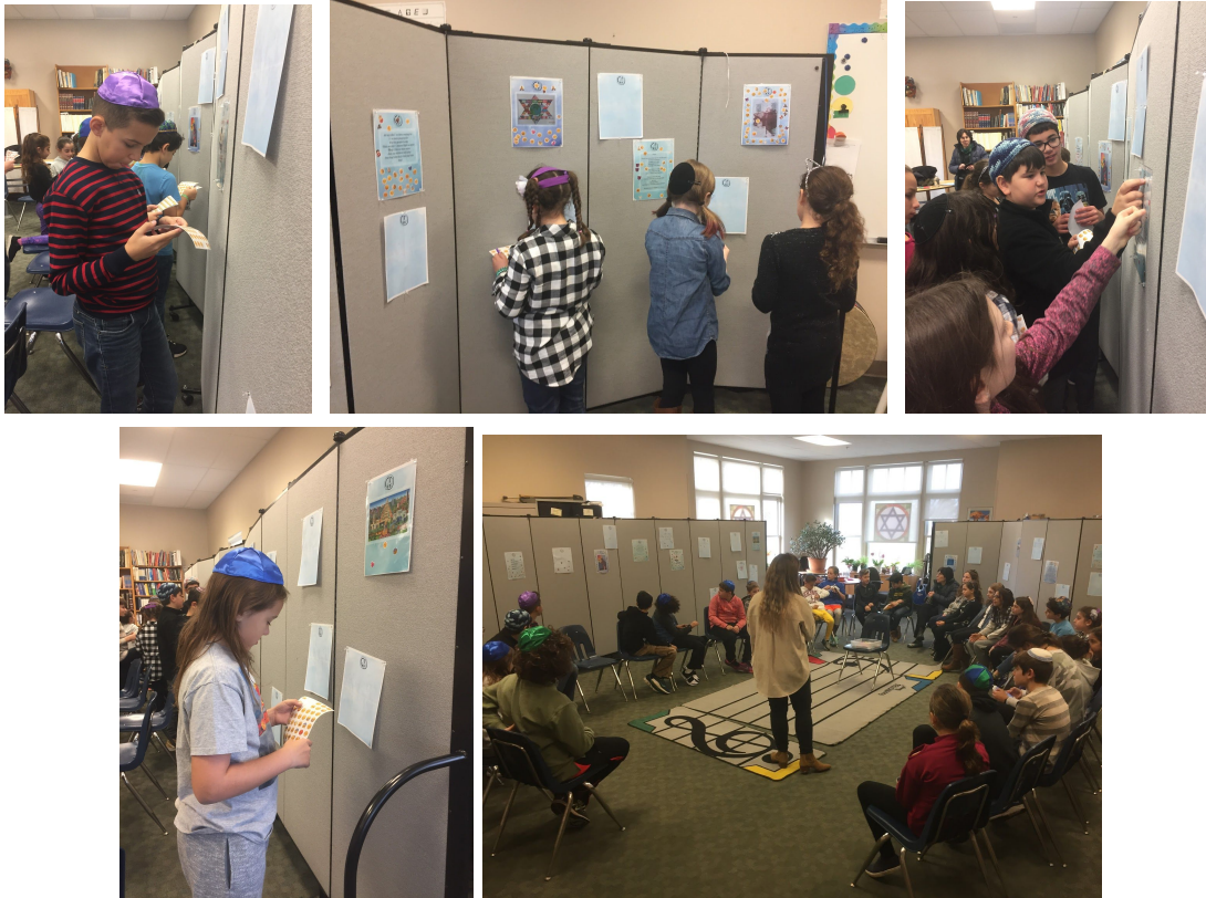
Our Voting Booth Mishnah Class-What should you do when you find a lost article?