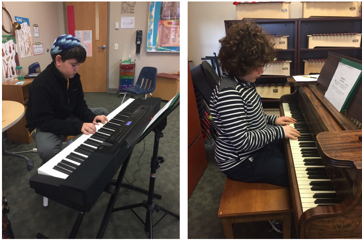
Honoring the memory of Yitzhak Rabin z"l