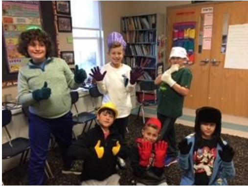
Sporting our Thinking Hats and Action Gloves