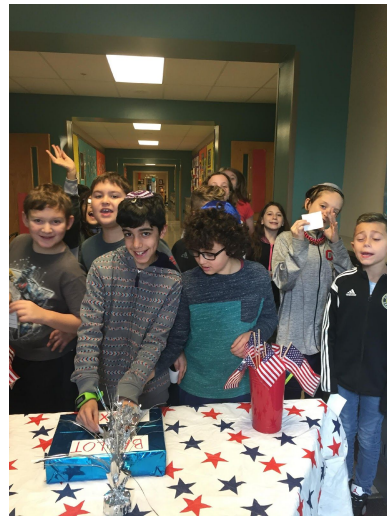
Don't forget to vote!