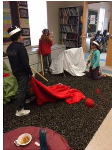
Building and Consecrating the Mishkan (Skit during Kabbalat Shabbat