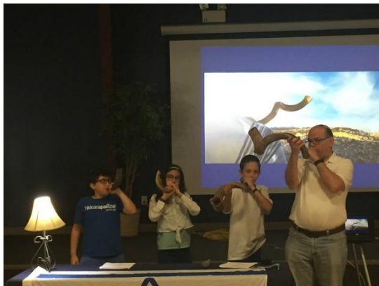
Transition to Yom Ha'Atzmaut celebration!