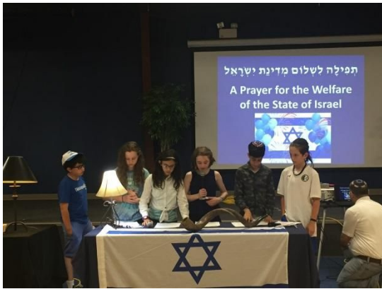
Reciting the Prayer for the State of Israel ....and Yizkor.