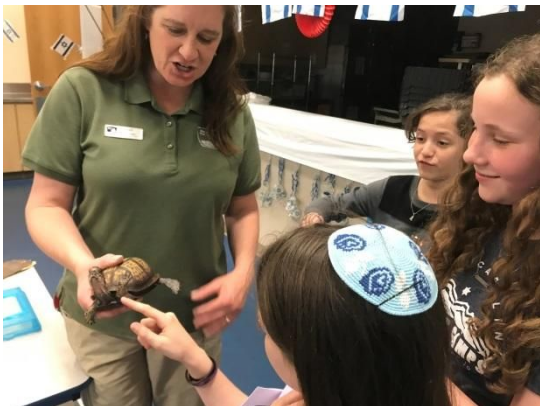
Making friends with a snapping turtle!