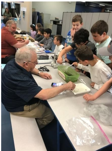
At the Environmental Science Fair