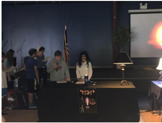
Announcing a moment of silence