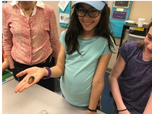
"This one's a male!"