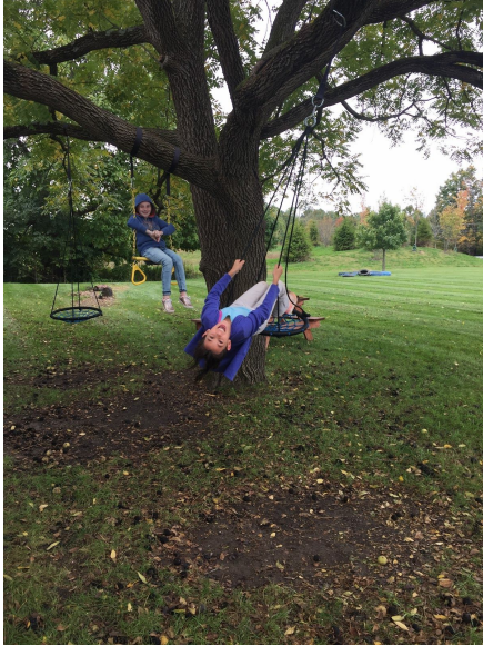
Having fun on the fields!