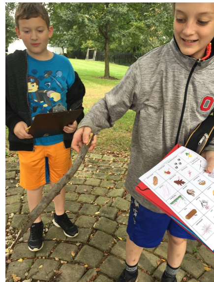
We found a frog during our nature scavenger hunt in Environmental Science.