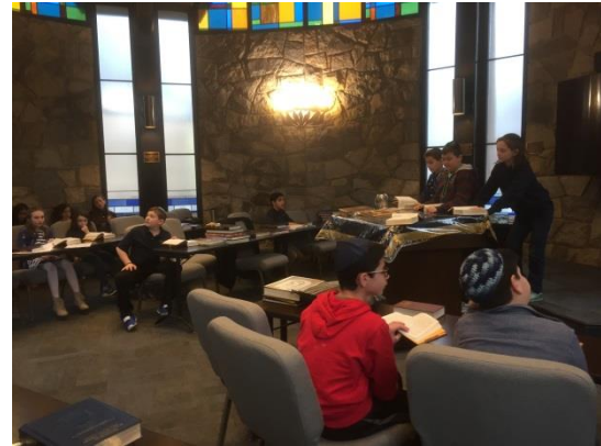
Tefillah in the chapel