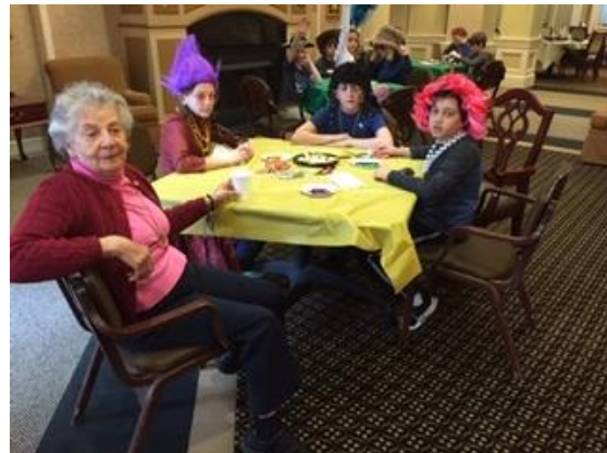
Purim at Creekside...How do we look?