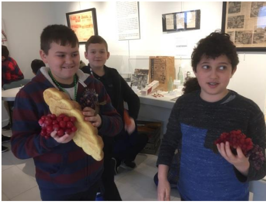
"Where could we buy kosher food in those days?"