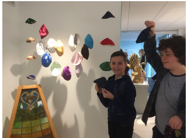
Better Together - Wexner Heritage Village - Creekside at the Village