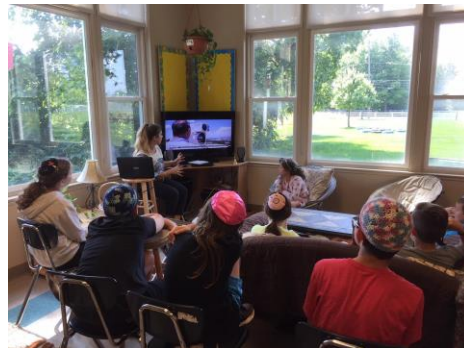
Nevi'im Class - Who is a Prophet?