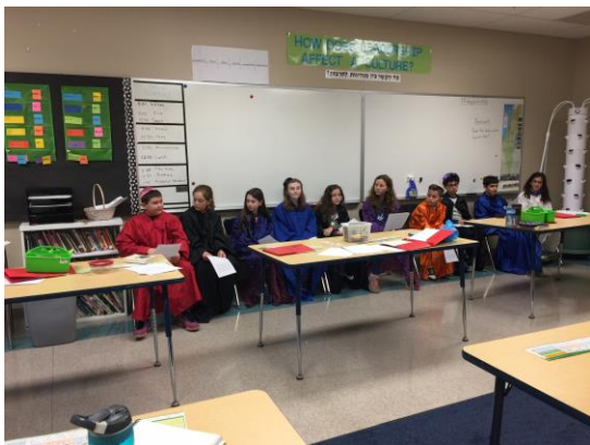
The "Justices" assemble

Should Moshe be allowed to be the leader of the Israelites? (Case argued the Friday before winter break.)