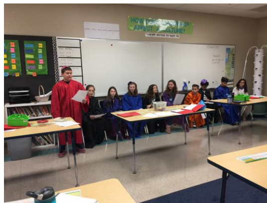
Leeon offers the opening argument.