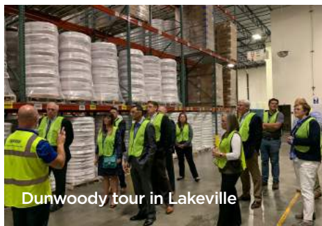
Dunwoody tour in Lakeville