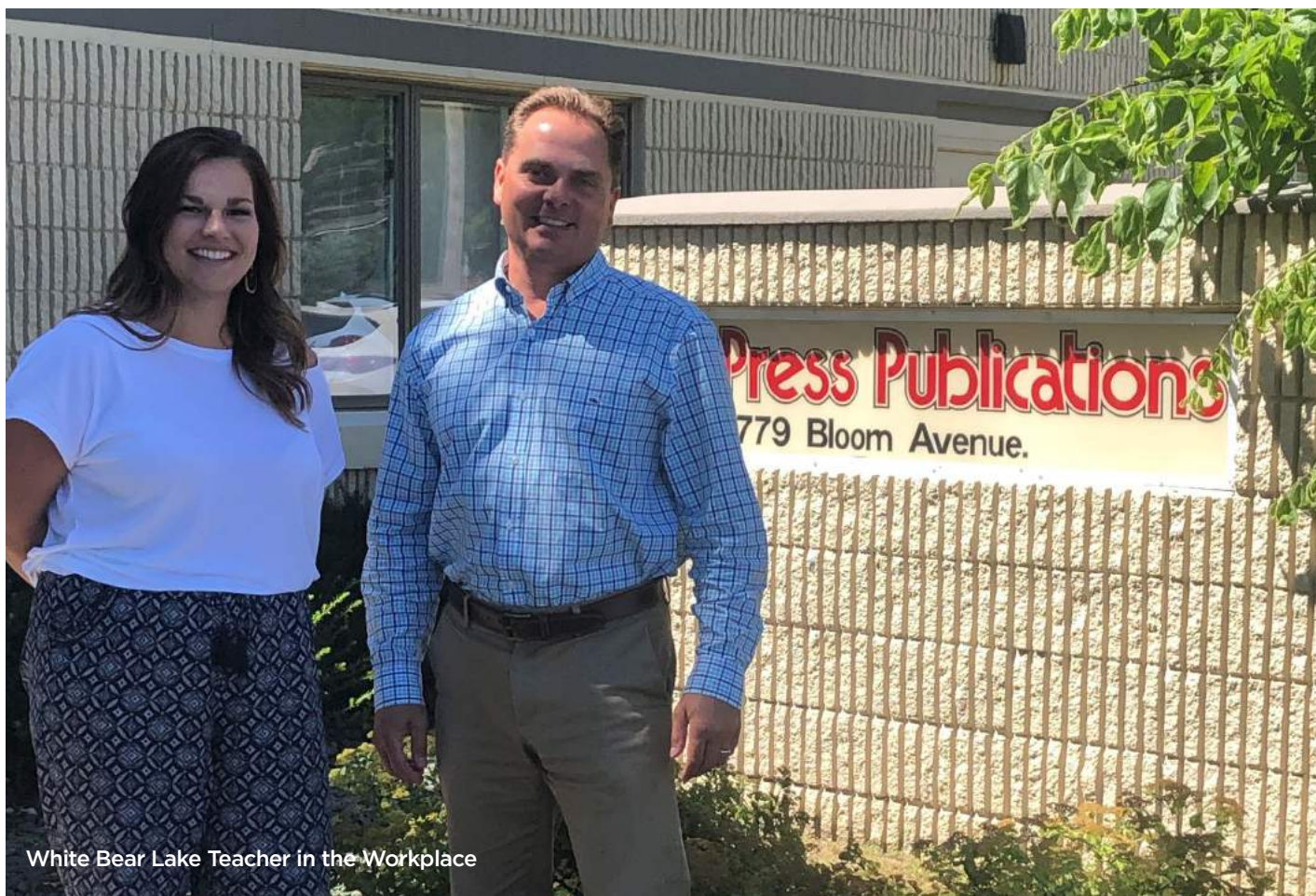
White Bear Lake Teacher in the Workplace

High school teachers experience immersive training and exposure to specific industries by working at companies in those industries for a time during the summer. They take this experience back to their classroom in the fall, utilizing what they have learned to develop or revise curriculum to reflect the needs of the economy.