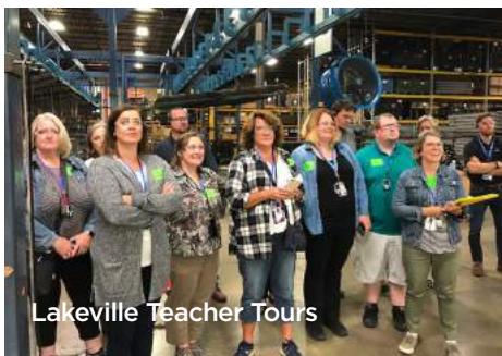
Lakeville Teacher Tours