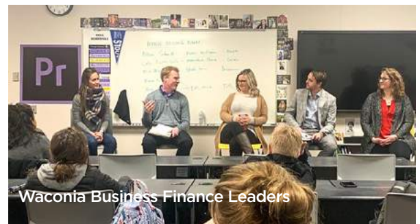
Waconia Business Finance Leaders

Business owners talk with students, often about what jobs are like at their companies and the classes students should take in order to be ready for certain jobs. This interaction, whether personal or virtual, provides students a real life perspective of career options in a specific industry or company, while at the same, time, providing business leaders, typically many years removed from the classroom, the student perspective on the future of work.