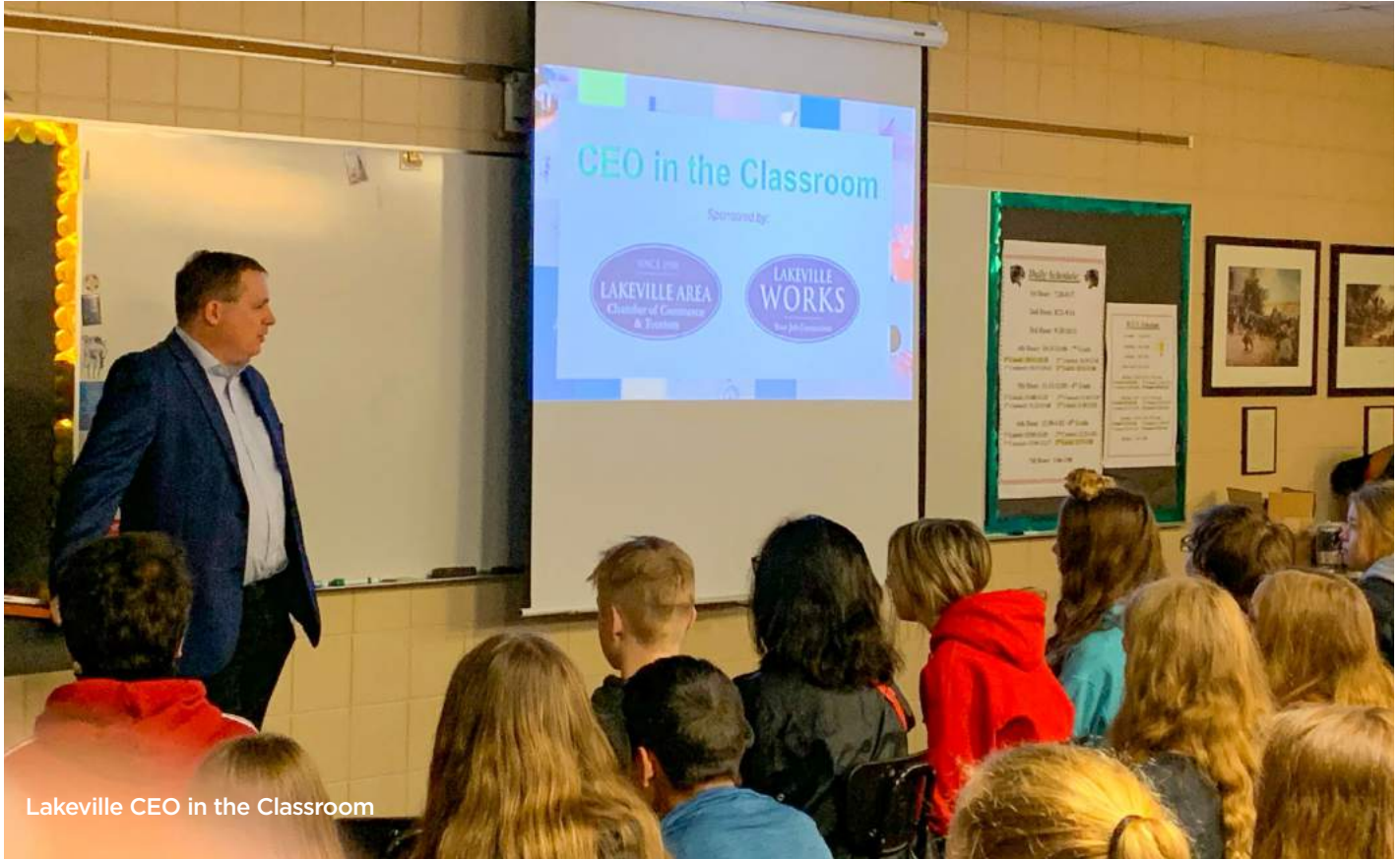
Lakeville CEO in the Classroom