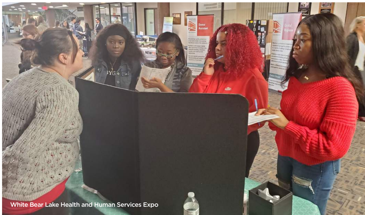
White Bear Lake Health and Human Services Expo