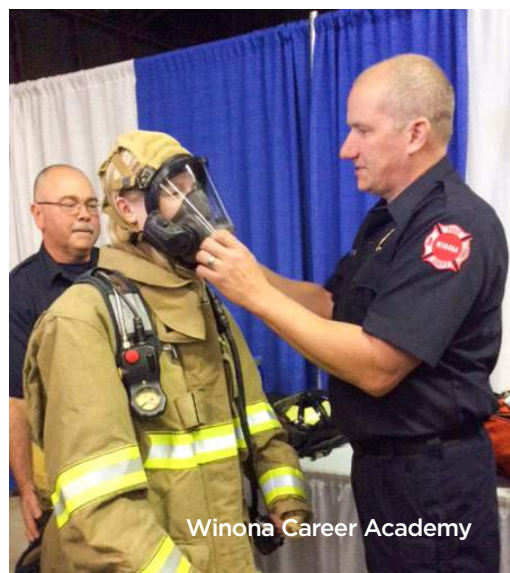
Winona Career Academy

Career academies require a committed school district, paired with an equally committed local business community to drive success. Career academies combine a college-preparatory, career and technical curriculum with a career opportunities, targeted to high demand careers in the region. When students are more engaged in school, they are more likely to succeed academically and graduate. Studies have found that students enrolled in career academies have higher grade point averages, higher test scores and lower dropout rates than non-career academy students in the same schools. As importantly, this partnership with business allows for internships, part time jobs and full time career options after graduation. Or for some, entry into a higher education program that will lead to a future career. Not to mention, in many districts, students have the opportunity to earn higher education credits while in high school.