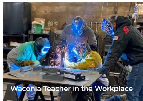
Waconia Teacher in the Workplace