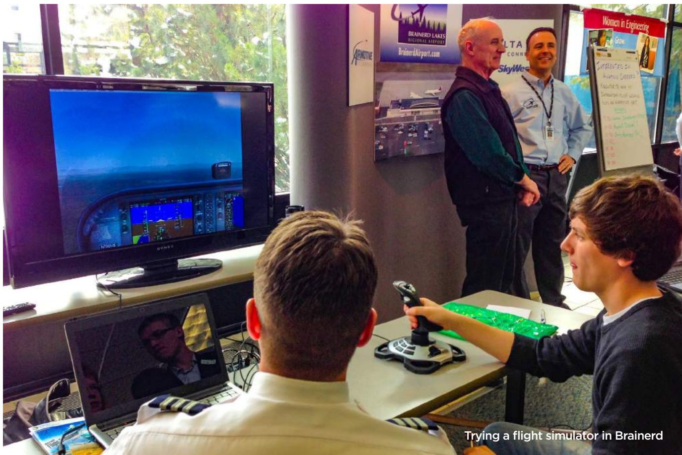
Trying a flight simulator in Brainerd