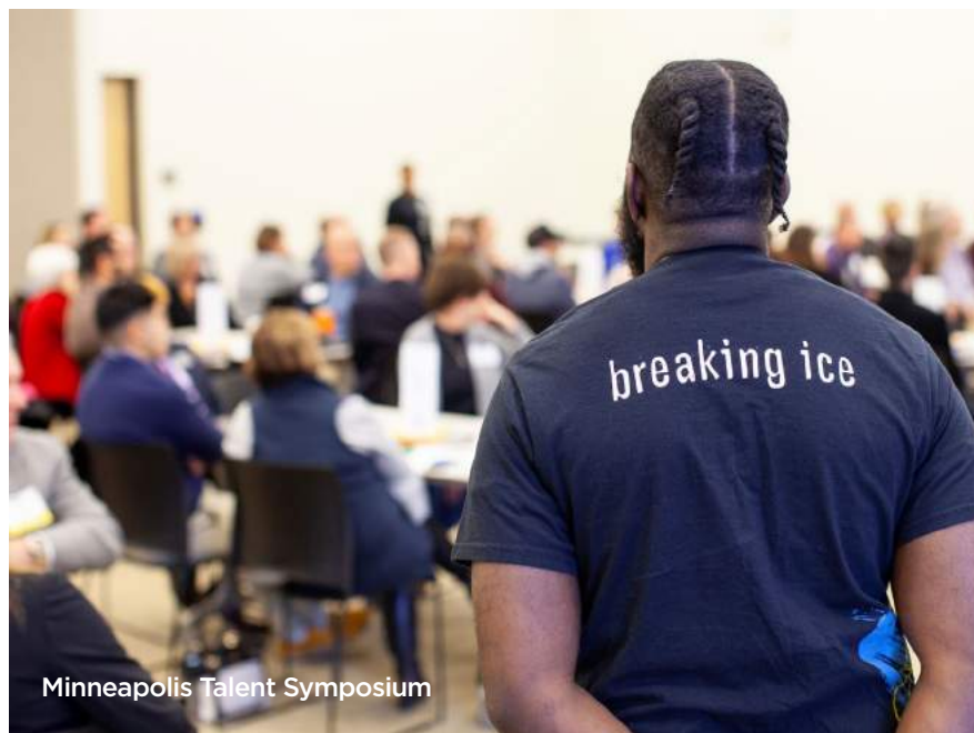
Minneapolis Talent Symposium

Local employers host high school students in a tradeshow-like environment, allowing them to explore jobs and careers that are available in their communities. Thousands of students are exposed to an entire range of jobs in a region. Engagement is much more impactful when students are given the opportunity to “see, touch and do.” In some communities, students go to the business to experience work environments and see employees in action. And while perhaps not as robust an experience, some of these career exploration opportunities have gone virtual, providing greater accessibility.