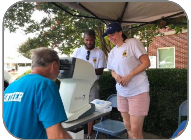
Greer Centennial Lions used the glaucoma screening machine at the Benson Classic Car Show and screened 35 individuals