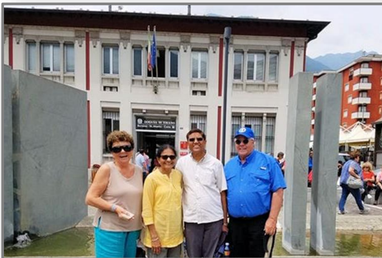
Four of five Lions from North Charleston Lions club who attended International Convention in Milan