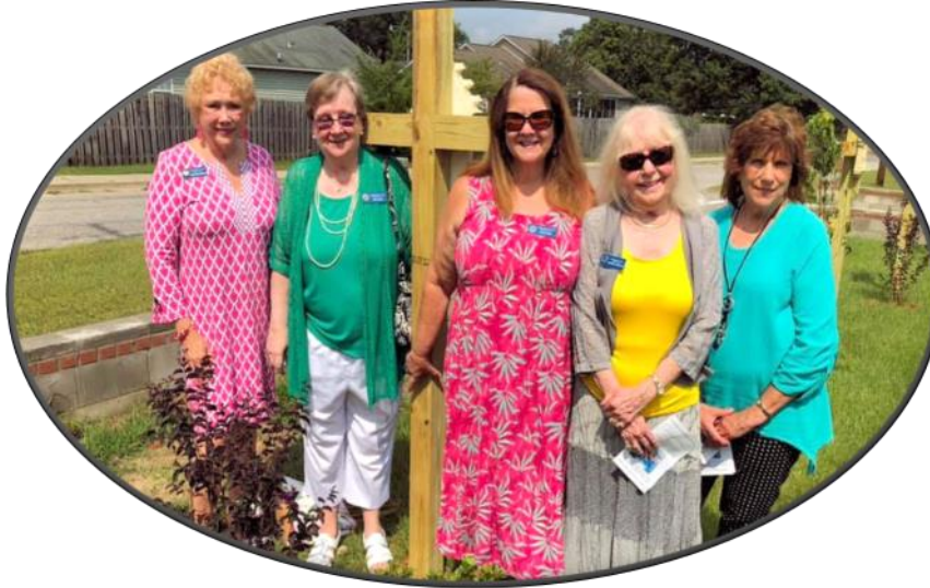
Dedication service held at St. Gerard's Catholic Church for trees purchased by the club and other groups.