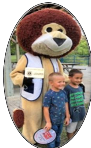
Lion Mascot Leonardo amuses the children waiting for the movie