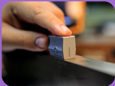
PCN UT 3.1 & 3.2 Level II

We are providing PCN Courses (in conformance with ISO 9712) in India through our partner M/s Lavender International, U.K. Lavender International is a world leader in Non-destructive Testing (NDT) Training & Examination. They are accredited by major NDT organisations, to provide Training and Examinations suitable for internationally recognised central and employer based certification schemes.