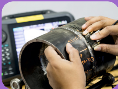
PCN PAUT Level II