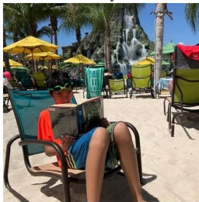
Prinze: Volcano Bay in Universal Orlando, Florida

These are the creative locations where our students read during the summer.