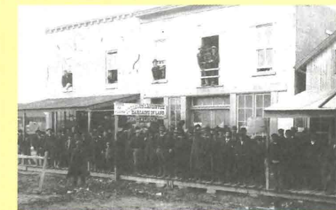
People crowded at Kansas land offices, sometimes sleeping in line overnight. This Garden City office helped clients waiting at the front door...and at the back windows!