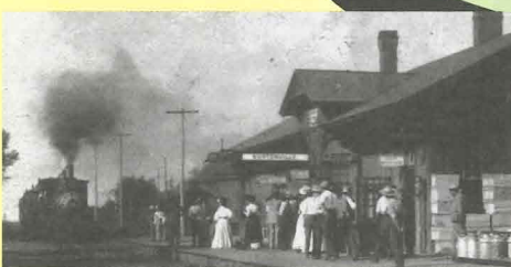
The Atchison, Topeka and Santa Fe Railroad sold millions of acres in Kansas and offered free train passes to land buyers.