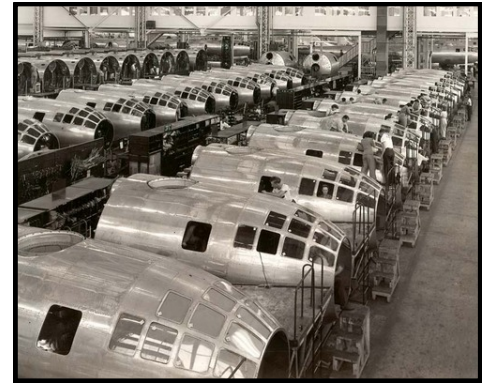
Boeing Airplane Company, Wichita, KS, 1943

Wichita, in south central Kansas, has been called the "air capitol of the world," producing airplanes for individuals and the military. Boeing, Beechcraft, and Cessna are just a few of the companies that manufactured aircrafts in Kansas.