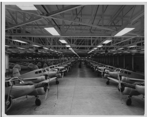
Cessna Aircraft Assembly Line, Wichita, KS, 1944