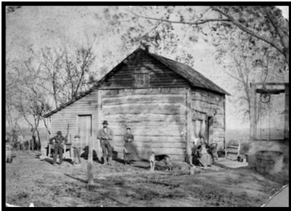
Kansas Memory 205874

Settlers cut trees into logs and then stacked the logs to build a cabin. Most log cabins consisted of just one room. Some cabins had multiple levels.