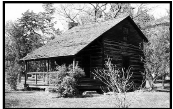
Kansas Memory 204949

As sawn lumber became more available across Kansas, log cabins were eventually replaced with frame structures. Some log cabins are still standing today, representing our state's rich history.