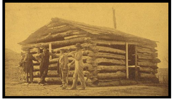
Kansas Memory 207743

Log cabins were one type of housing built by early Kansas settlers. Cabins were more common in eastern Kansas where trees were readily available. Since the west had limited access to lumber, settlers in that region built homes out of other materials such as sod.