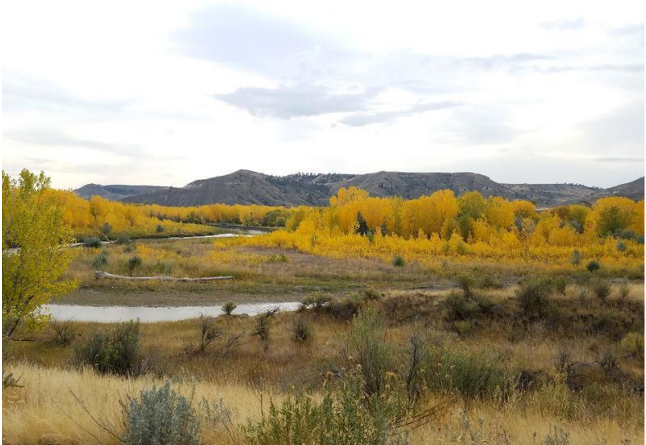
Upper River Missouri Breaks on Sept.30, 2017, in Montana.

BISMARCK, N.D. (AP) — Attorneys general from a dozen western states want the Trump administration to halt a proposal by the U.S. Army Corps of Engineers that they say usurps states' authority over their own water.