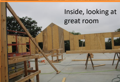
Inside, looking at great room

Our general contractor is BD Construction