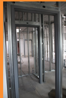
Door frames are installed below.