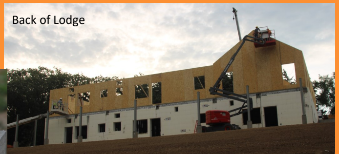
Back of Lodge

Good progress is being made on the Olson Lodge.