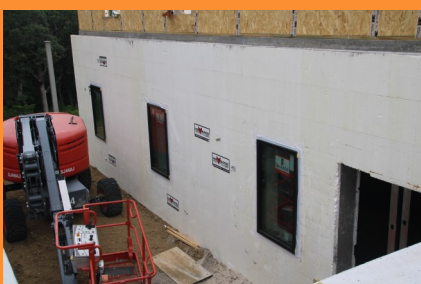
Lower level windows Are installed