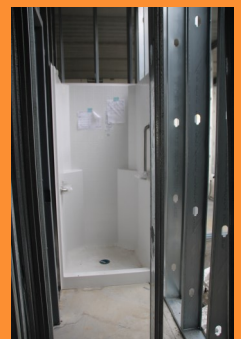
Showers are installed