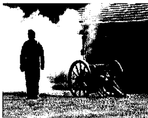
Old Fort Jackson, Savannah