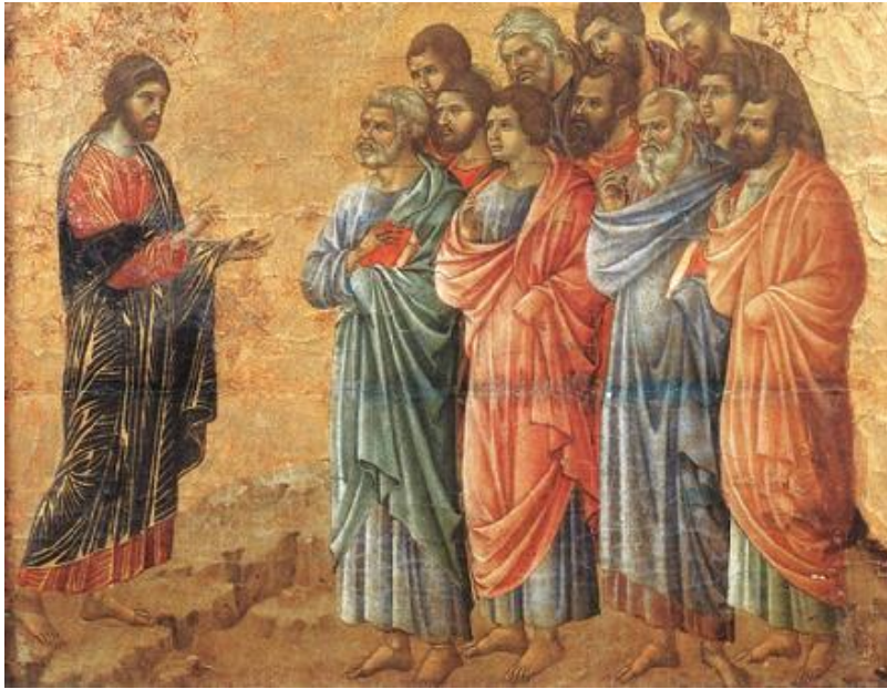
Appearance on Lake Tiberias, Duccio, 1308

Welcome to worship this morning. Please always wear your mask during the service. In addition, please keep a physical distance of 6ft from people you do not live with. The clergy, and readers have all been vaccinated and will be removing their masks to speak.