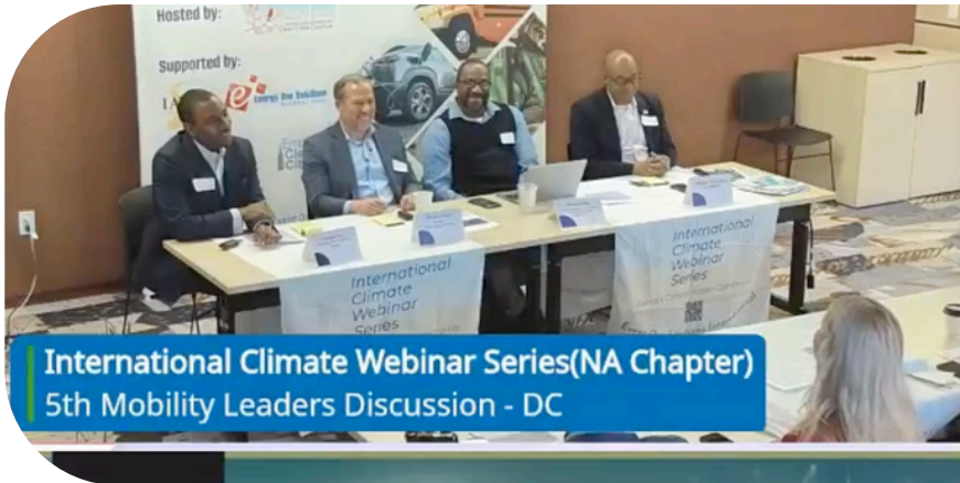
International Climate Webinar Series(NA Chapter) 5th Mobility Leaders Discussion - DC