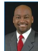
Oscar Braynon II State Senator Florida's 36th District