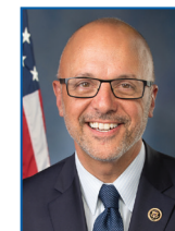
Ted Deutch Congressman Florida's 21st District