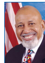
Alcee L. Hastings Congressman Florida's 20th District