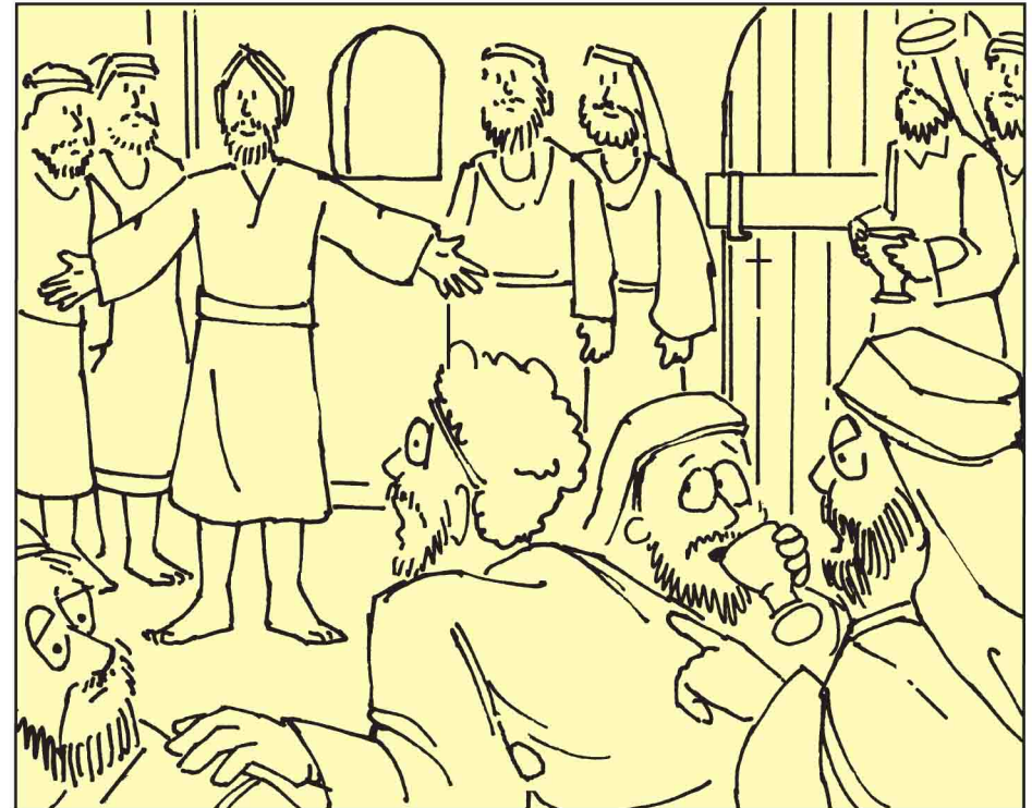
Christ Church Episcopal Parish

Enter your SECRET CODE to unlock games @ games.childrensbulletins.com