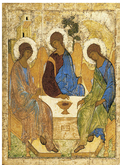
"Trinity" (1425) by Andrei Rublev