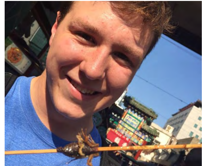
Life in Beijing: Food!