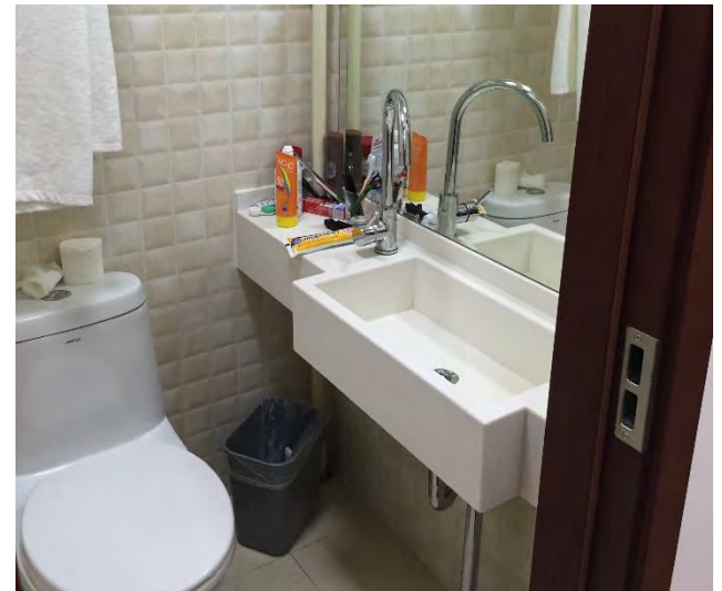
Life in Beijing: Accommodations and Classwork