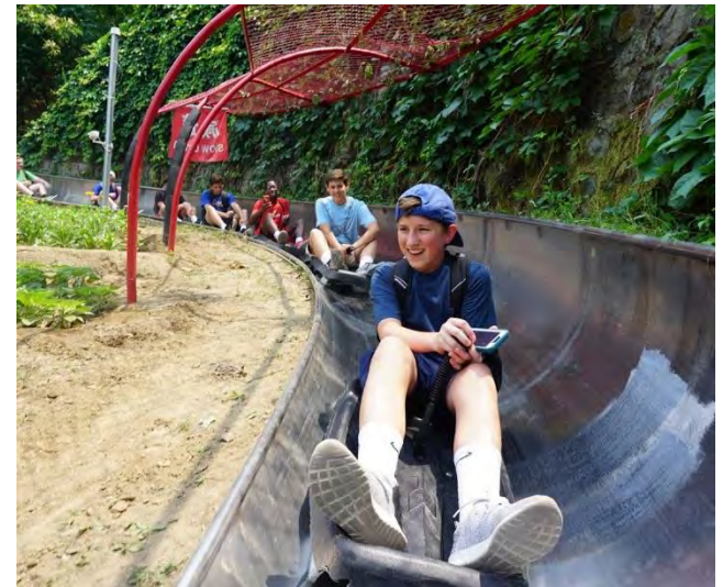
The Village at Mutianyu