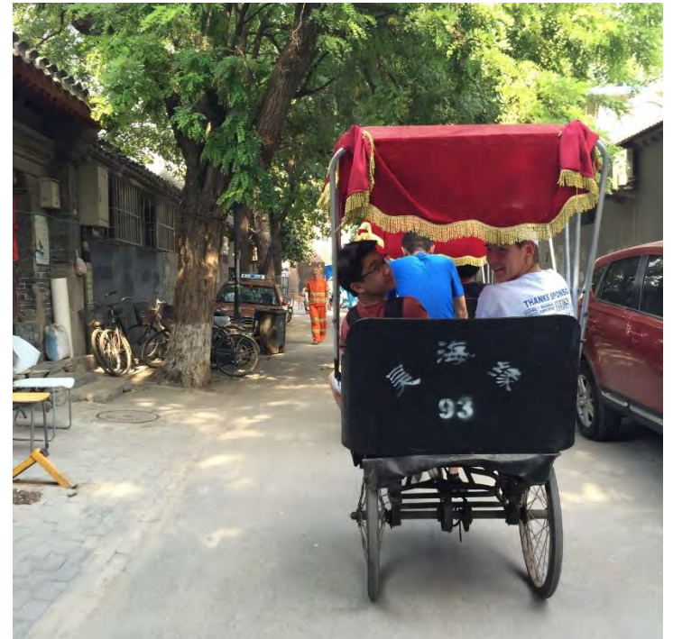
Cultural Sites in Beijing