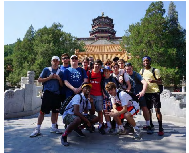
Historical Sites in Beijing