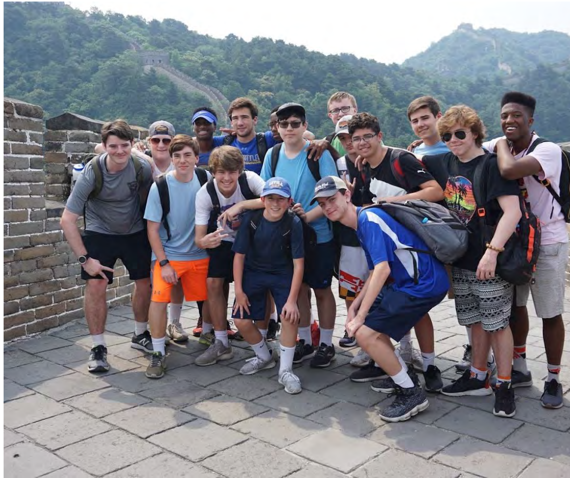
The Great Wall