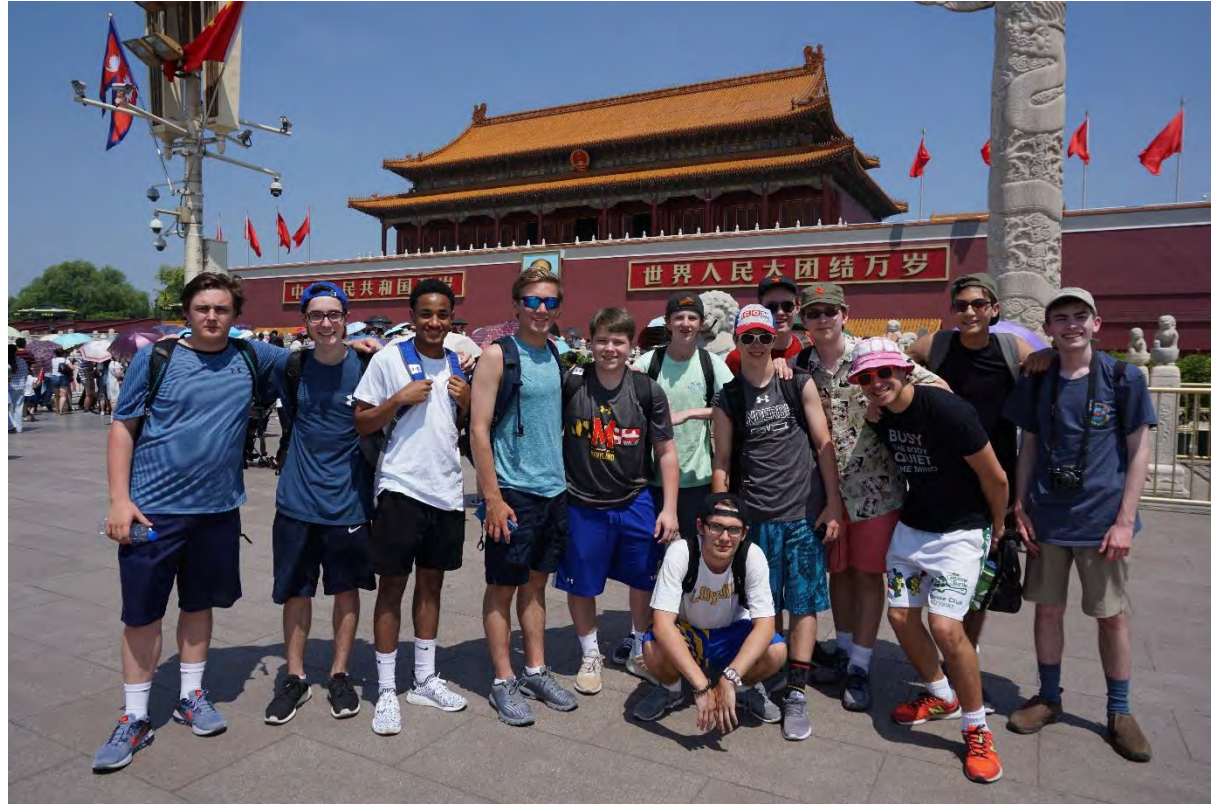
The Forbidden City