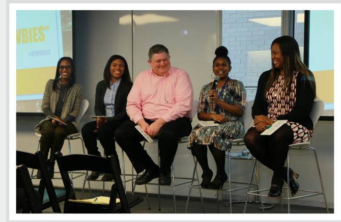
Customer Relations representatives chat about their role at the Quarterly All Staff Meeting.