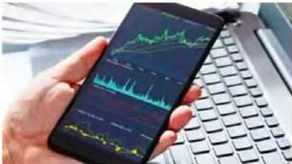
From a market perspective high beta sectors like autos, financials select consumer discretionary plays will be impacted.

Auto, retail, SMEs may face brunt of 2nd covid wave