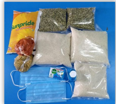
The food kit distributed in Bhuj village

Children's Hope India provided 41,405 meals to refugee families in Jodhpur with a supply of food that includes flour, oil, pulses, sugar, and other essentials. In New Delhi, we provided 28,480 meals , including oranges, biscuits, jaggery and chickpea mix, and easy-to-cook khichdi packets. Through one- to three-month food supplies, we are providing 196,225 meals to Bhopal families , in addition to immunity booster drops for students . In Mumbai, we are distributing 1,200 meals to student families that have lost their ability to work. We are also delivering 11,000 meals to families in and around Bhuj village .