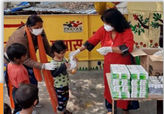
Food and hygiene kits distributed in New Delhi