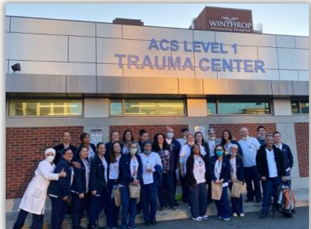
ER staff receive lunches and thank you notes