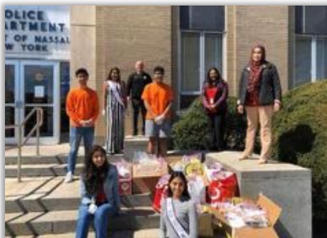
CH3 volunteers deliver lunch to police station