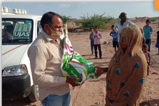
Refugee families receive food packets in Jodhpur