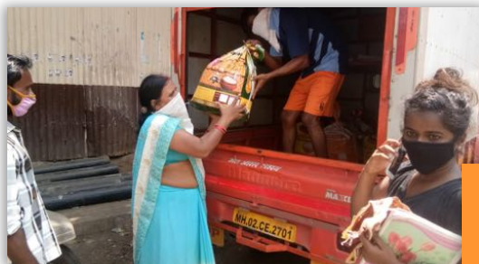
Families pick up food allowances in Mumbai