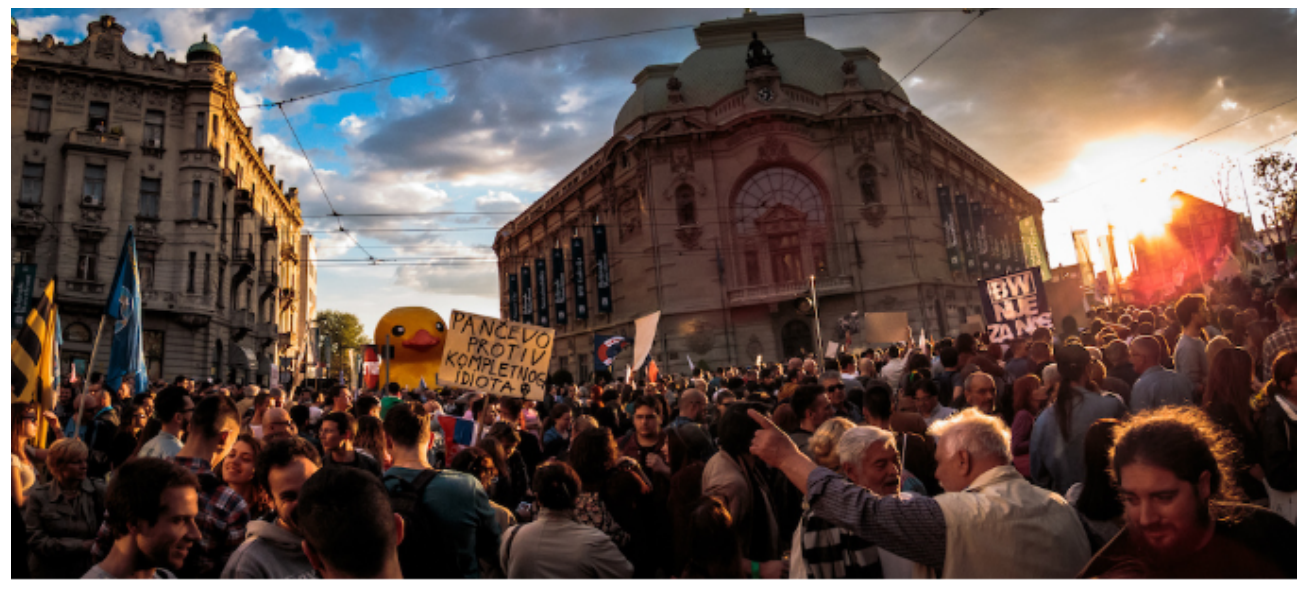
A great protest organised by "Ne da(vi)mo Beograd", commemorating a year after violent demolition, done by "phantoms" during election night in 2016

The initiative "Ne da(vi)mo Beograd" / "Don't let Belgrade D(r)own" was formed in 2014 as a reaction to the way the urban development of the city of Belgrade was conceived and carried out, with the specific goal of preventing further degradation of public good and resources in the name of colossal, non-transparent & fraudulent urban project "Belgrade waterfront". In previous four years they have achieved an enormous amount, especially considering that this entire effort is carried on the shoulders of volunteers most at various stages of their university studies.