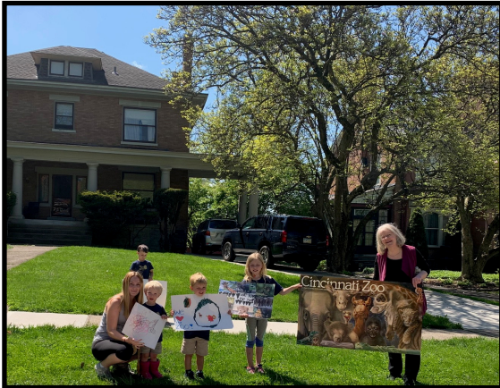
Zoo T-Shirt Parade to Support the Zoo!