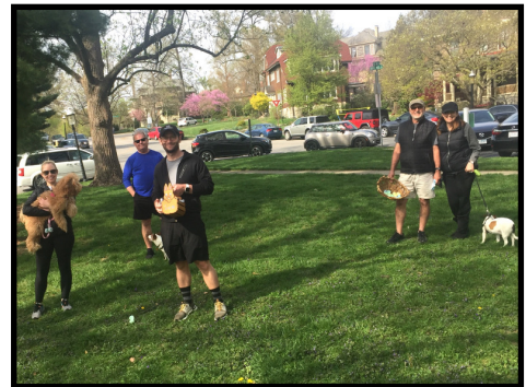
Front Porch Pours on Burton Woods, Friday April 24