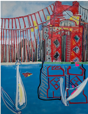
Joseph Loria, "The Bridge" 60" x 48", oil stick, spray paint and tape on canvas