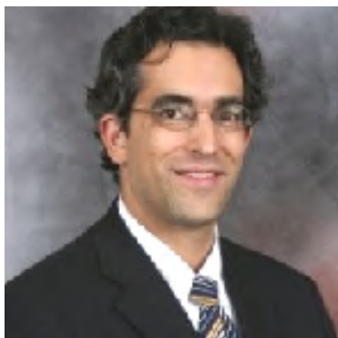
Erik Calderon FLMC Films