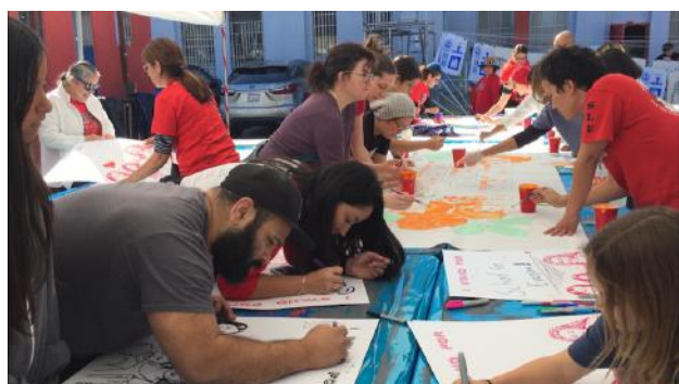
Click here to watch the Milwaukee Art Build video.

Where: Maryland State House 100 State Cir, Annapolis, MD 21401