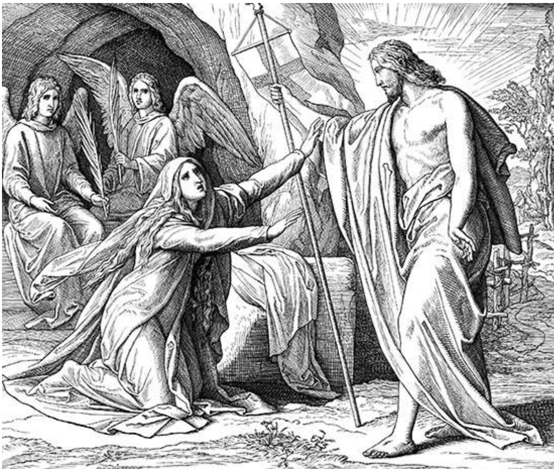
JESUS APPEARS TO MARY MAGDALENE