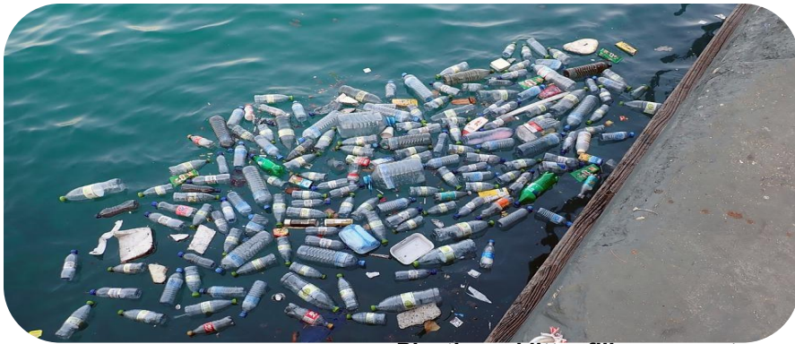
Plastic and litter fill ocean waters.