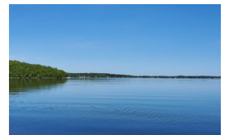
The breathtaking beauty of Harding Lake at Camp Bingle