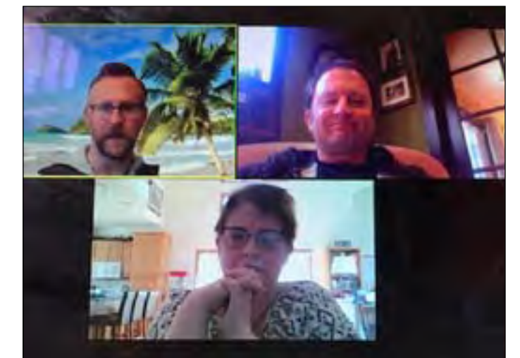
STAFF MEETING • APRIL 21