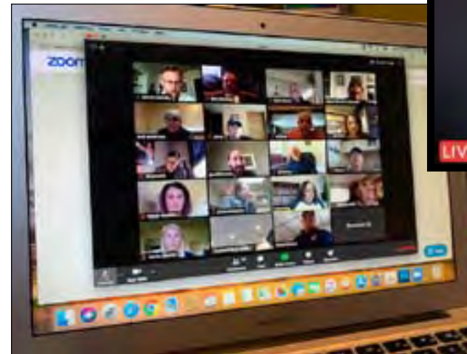
BOARD MEETING • APRIL 20