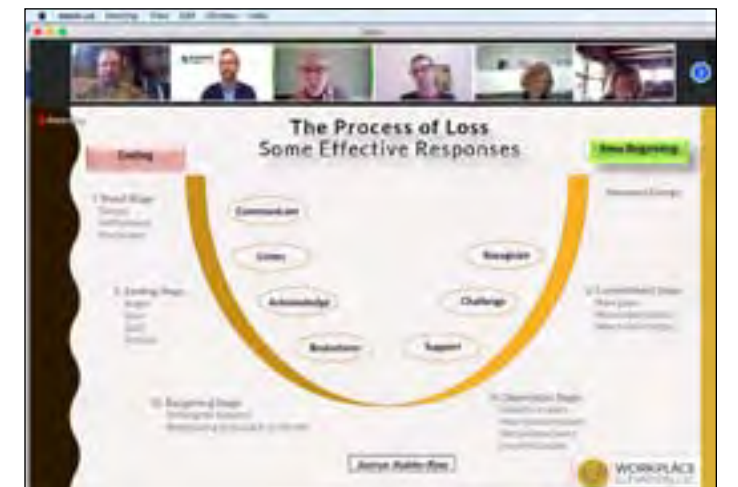
WORKPLACE ELEVATION WEBINAR • APRIL 29