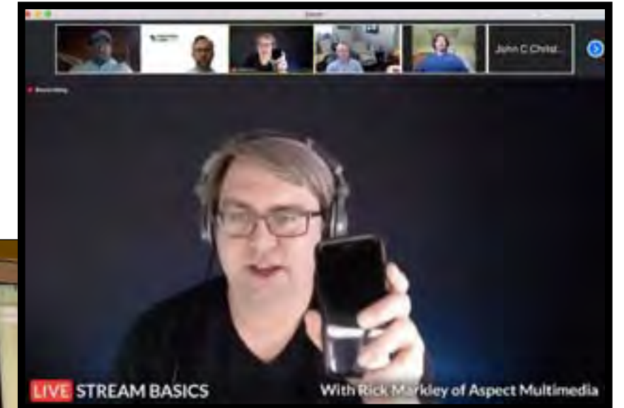
ASPECT MULTIMEDIA WEBINAR • MAY 1

The need for social distancing prevented us from holding some of our favorite events in April, from Business After 5 gatherings to New Member Orientation sessions. Fortunately, modern technology allowed us to transform our "Lunch & Learn" seminars into a "Restart, Rebuild" series of webinars. Staff meetings, Ambassadors Club gatherings and board meetings are being held online, as well, as was our relaunched Wake Up Baraboo event!