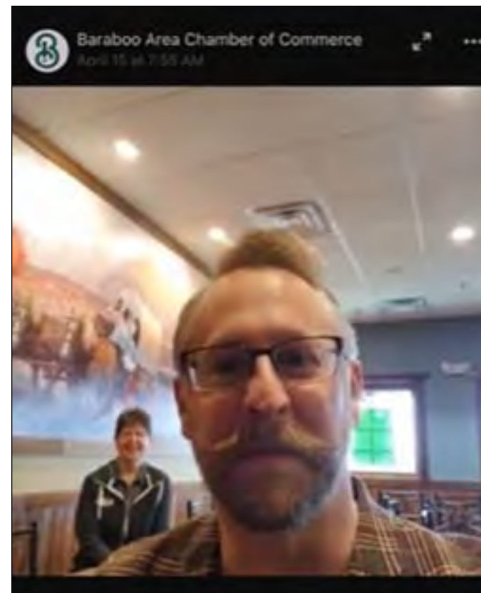
WAKE UP BARABOO • APRIL 17