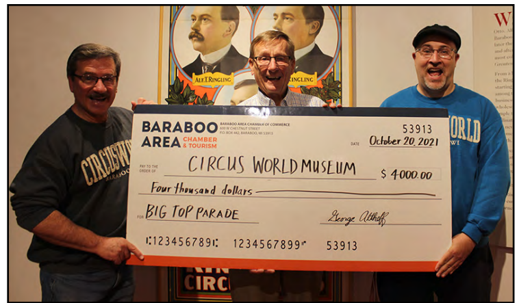
PRESENTING A CHECK TO CIRCUS WORLD • OCTOBER 20