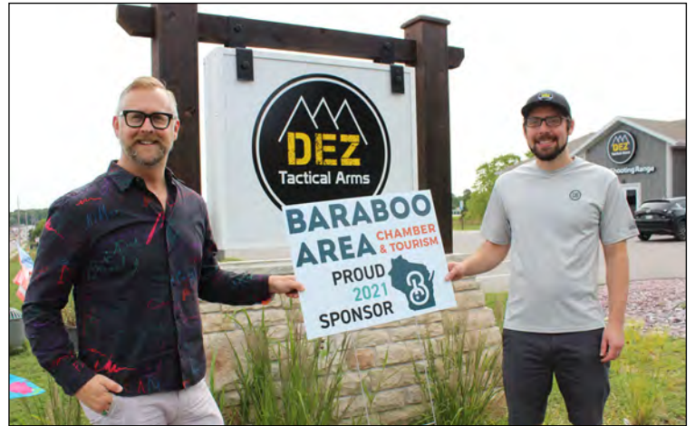
DEZ Tactical Arms