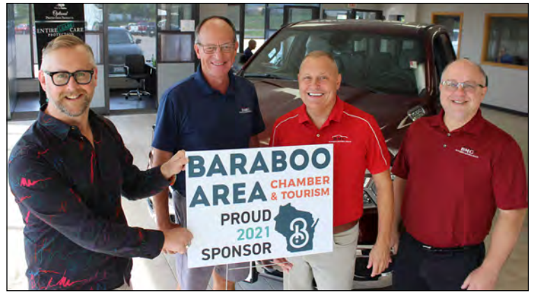
Baraboo Motors Group