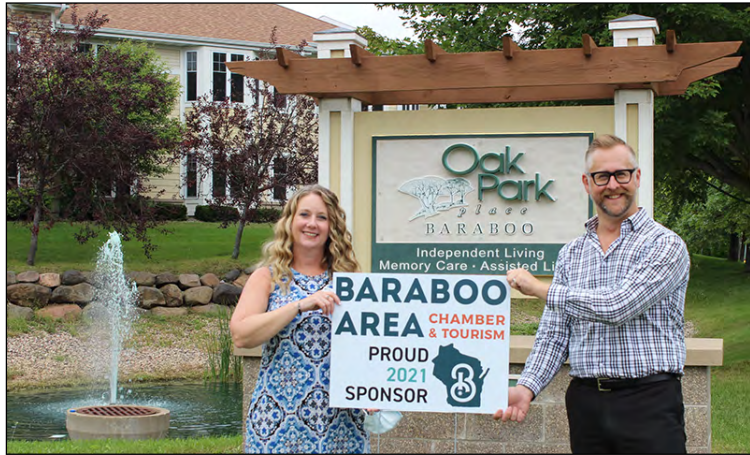
Oak Park Place