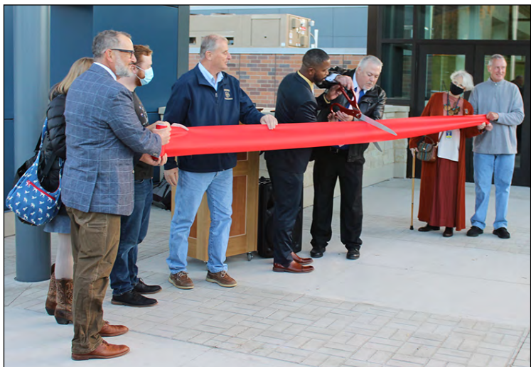
BARABOO SCHOOL DISTRICT DEDICATES REVAMPED JACK YOUNG MIDDLE SCHOOL • OCTOBER 25