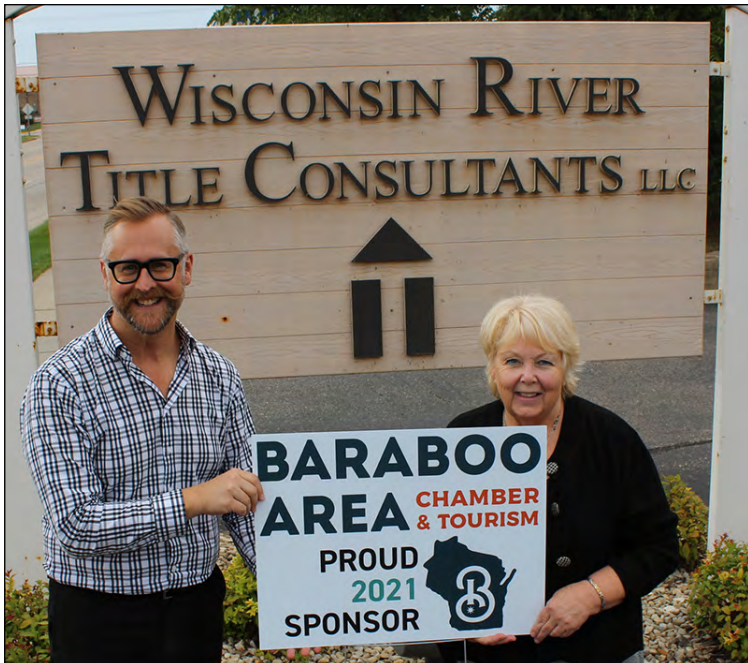
Wisconsin River Title