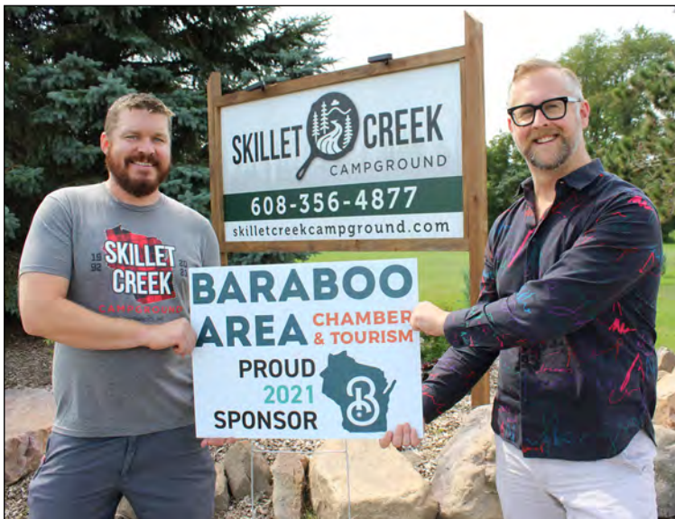
Skillet Creek Campground