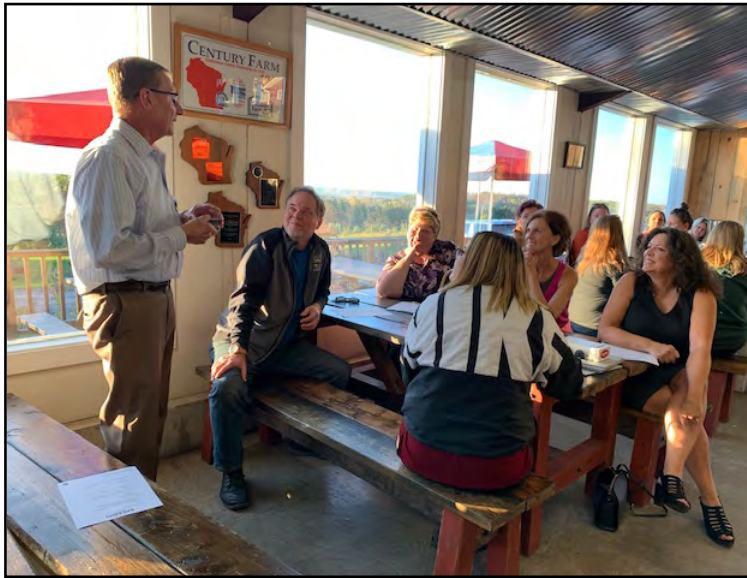
AMBASSADORS CLUB MEETING • OCTOBER 18 • SKI HI