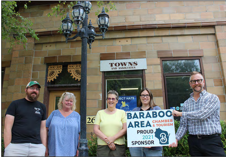
Towns & Associates