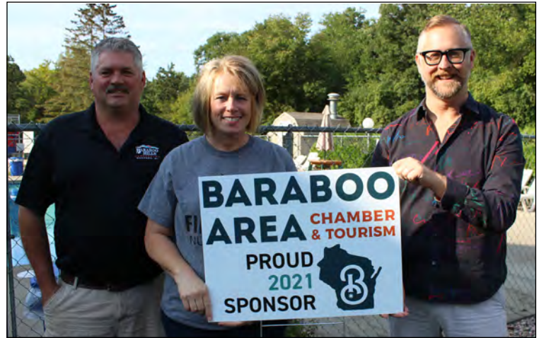
Baraboo Hills Campground