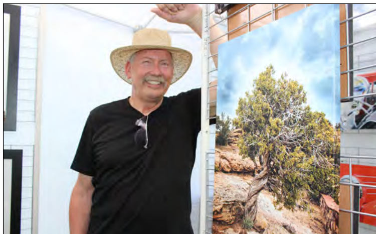
ARTJUNE • JUNE 19 • DOWNTOWN BARABOO