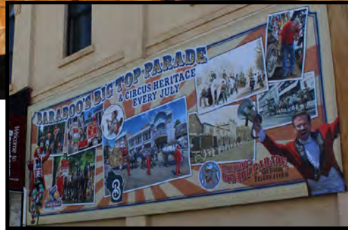
NEW DOWNTOWN PARADE & CIRCUS CELEBRATION BANNER • JUNE 11