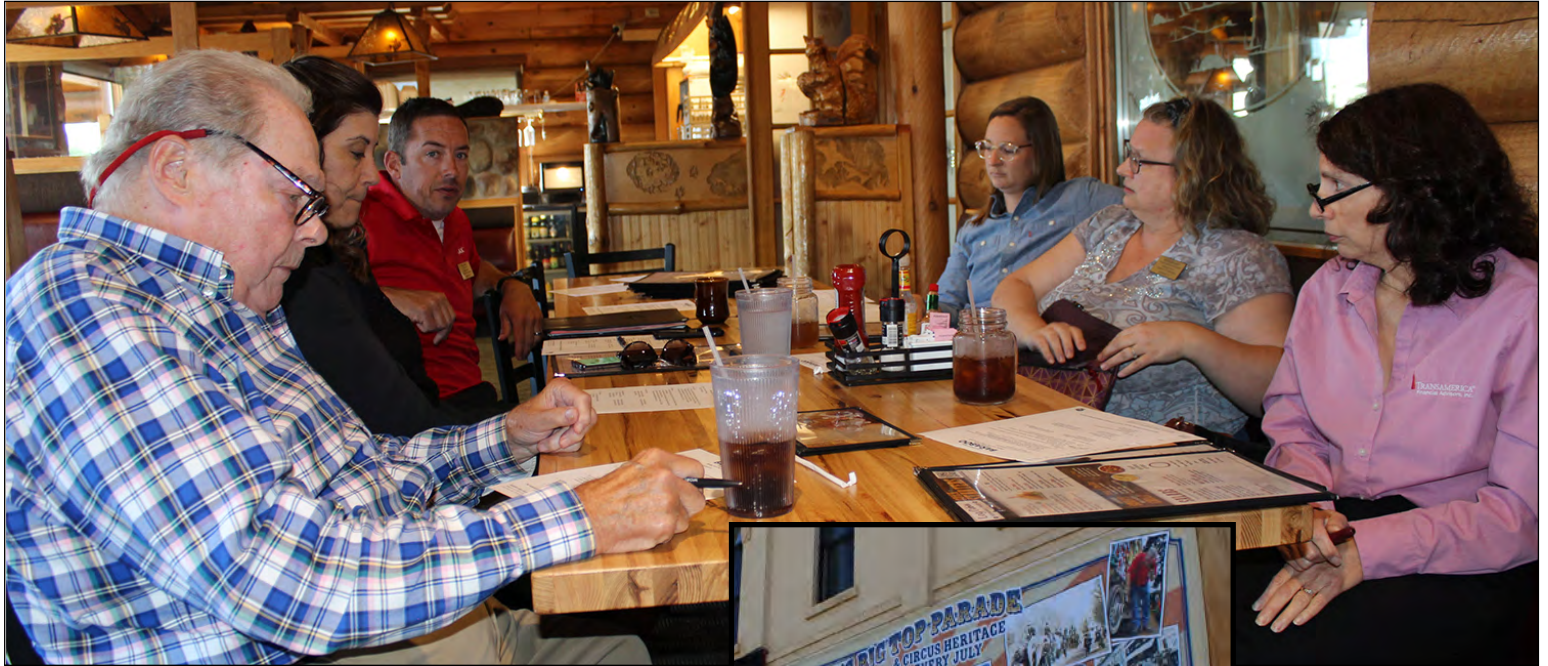
AMBASSADORS CLUB MEETING • JUNE 21 LOG CABIN RESTAURANT