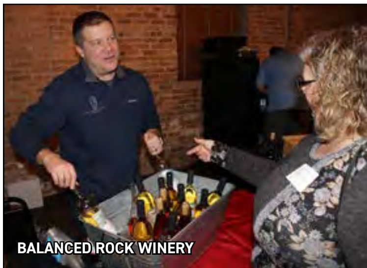
BALANCED ROCK WINERY