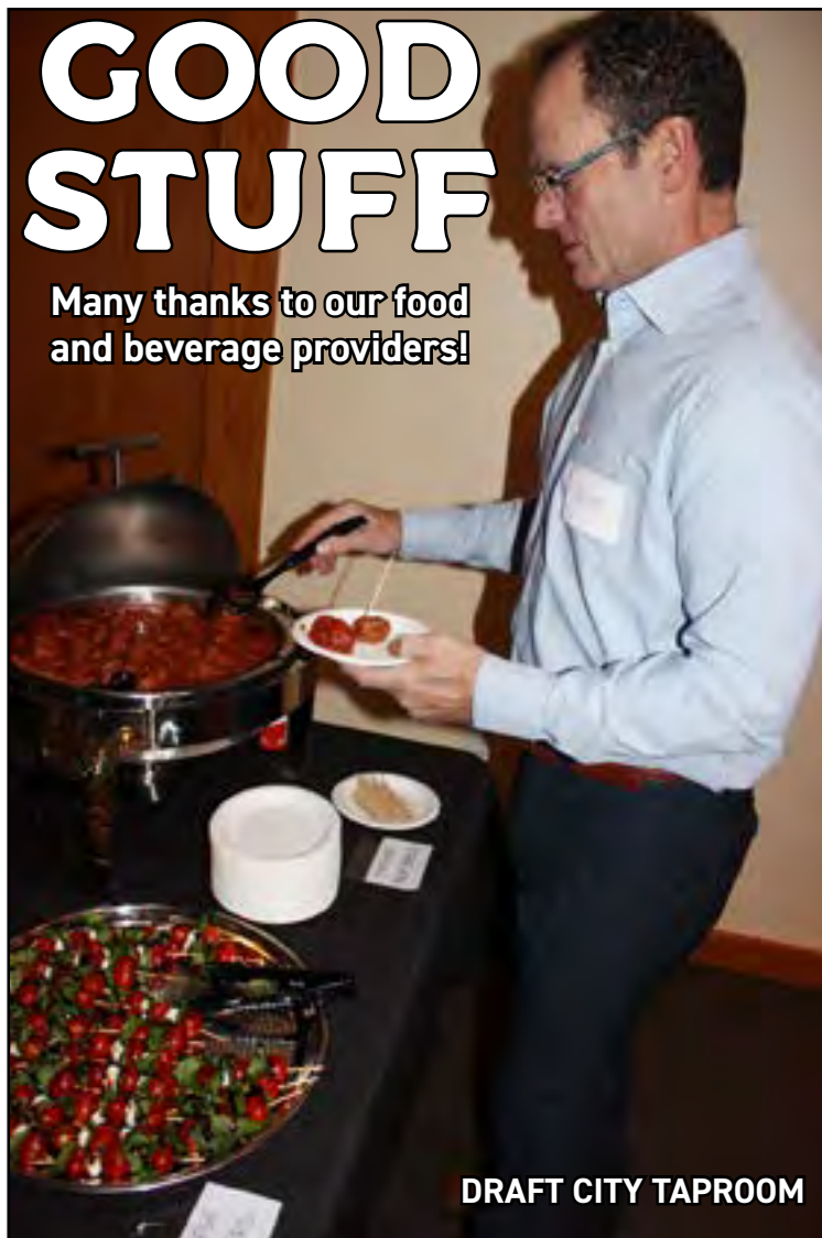
DRAFT CITY TAPROOM