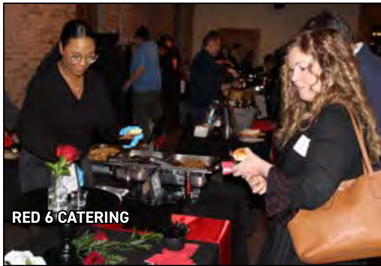
RED 6 CATERING