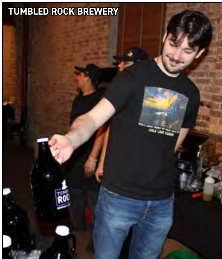
TUMBLER ROCK BREWERY