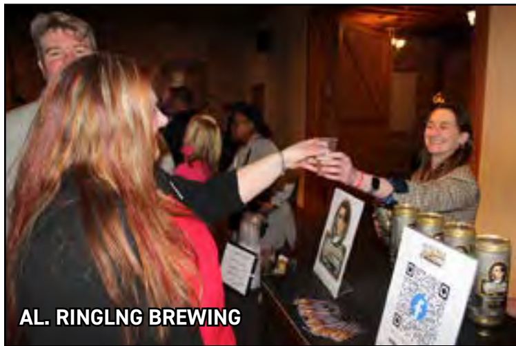
AL. RINGLING BREWING