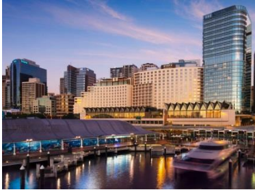
1. Hyatt Regency Sydney