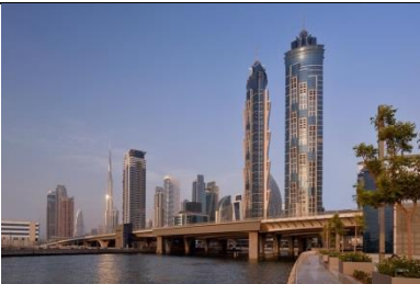
1. JW Marriott Marquis Hotel Dubai