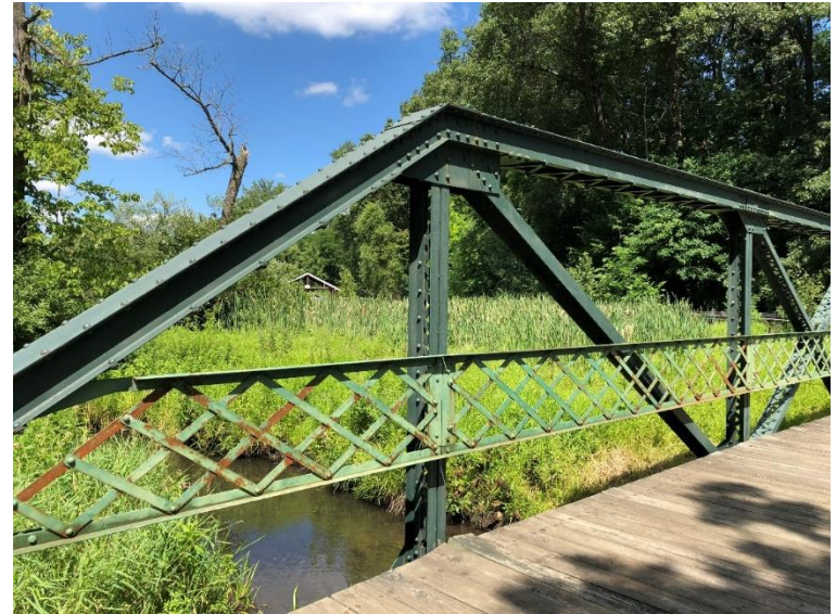
Historic Bridge Park