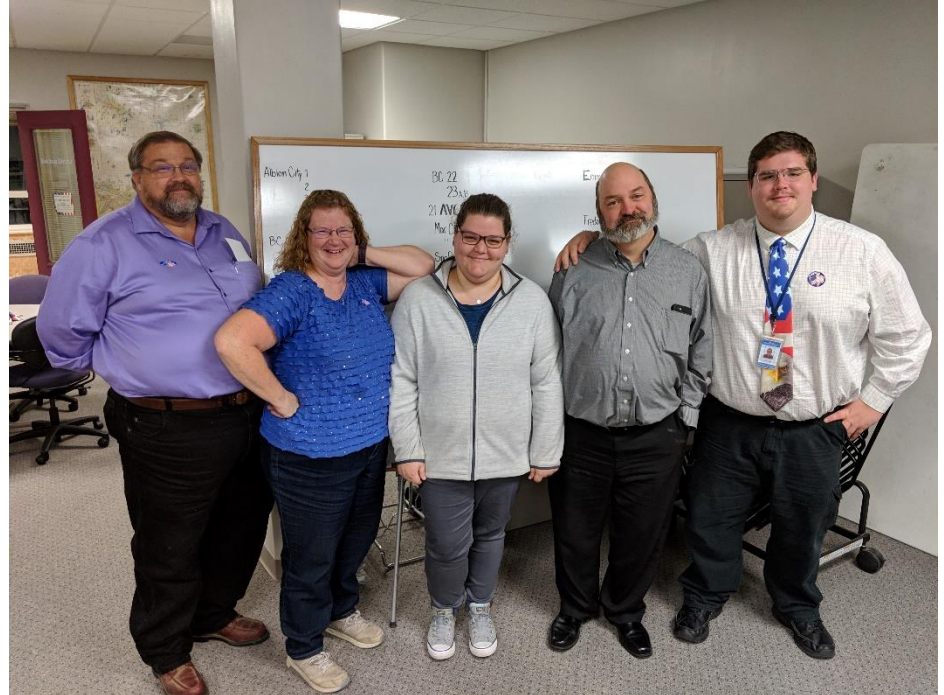
The Elections Team, which works with the Clerk of Elections to provide real-time results on Election Night